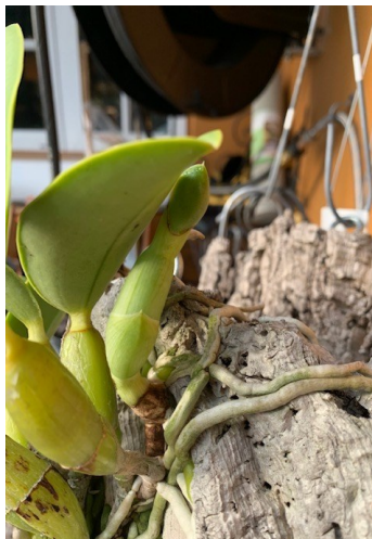
C. walkeriana flower growth #2 Feb. 2022

C. nobilior never blooms from leafed bulbs while walkeriana can at times. It also usually has 3 flowers per bulb and blooms later (February till April). The flowers look similar but nobilior is a bifoliate (two leaves) while walkeriana is unifoliate (one leaf)