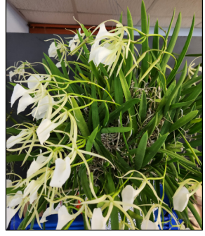
B. Little Stars Les Corbin