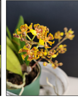
Trt. nanum Omar Gonzalez