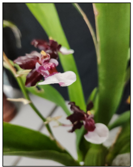
Onc. Sweet Sixteen Justine Vihnesky