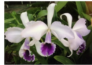
C. gaskellianae v. coerulea 'Blue Dragon'

Coral Ridge Yacht Club is located at 2800 Yacht Club Blvd. Fort Lauderdale, FL