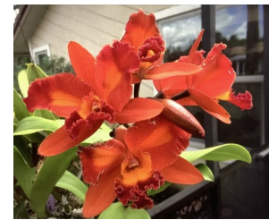
Lc. Aussie Cosmic Fire