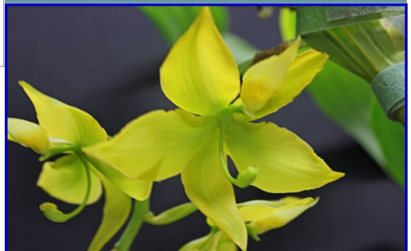
Cyc. Jem's Yellow—Rubben Howe