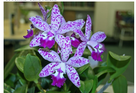
Lc. Tropical Pointer 'Cheetah' –Chris Binder