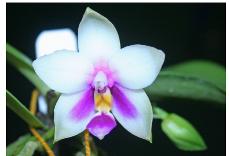
P. bellina–Saira Kaizad

They are also effective on most other ornamental plants. Refer to the manufacturer's label for complete details.