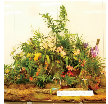
Museum of Discovery photo by Chris Crepage