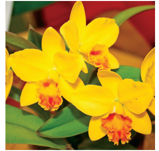
Blue Ribbon—Laurajeane Niesel Pot. Princess Taicla