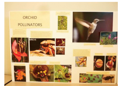
Museum of Discovery

The aim of our efforts was to educate the public, especially youngsters, about orchids. Past issues of "Orchids" magazine, pamphlets for FLOS and the Fakahatchee strand were free for the taking. In keeping with the muse-