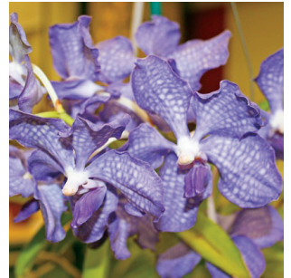
Blue Ribbon—Diane & Ruben Howe - Vanda Thailand Beauty