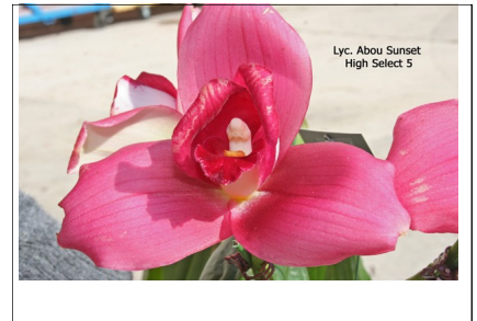
January 2012 FLOS Show