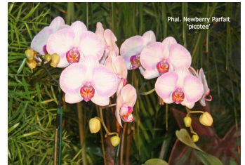
January 2012 FLOS Show