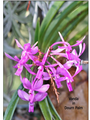
From former AOS garden