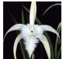
B. David Sanders 'Sunset Valley Orchids' AM/AOS