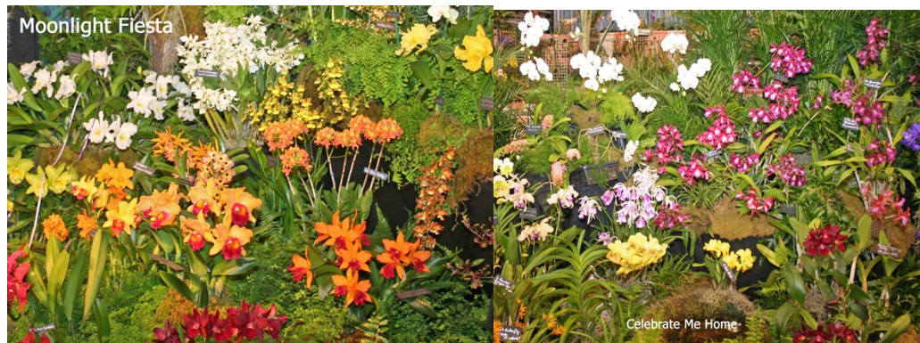
Two of the members' displays from the 2012 FLOS Orchid Show

We would like to report that we have received many compliments from vendors and patrons for our efforts and that attendance increased by over 245 visitors from last year.