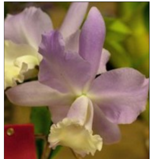
Brassocattleya Moon Mist 'Luna Dawn'