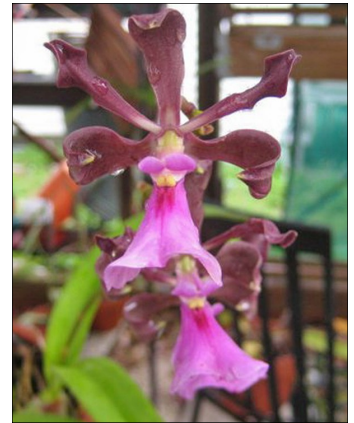
Enc. Cordigera var. Rosa