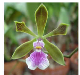
Encyclia tampensis.