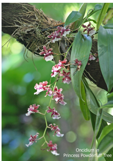
Taken in AOS garden

At the Trustees' Meeting in San Antonio last month, it was announced that the sale of headquarters of the American Orchid Society was approved and closing on the sale will be the end of November 2011. The Sandra C. Slomin Foundation and Family Center for Autism and Related Disabilities is purchasing the site to use as a day care facility and eventually a private elementary school to serve children with autism and related disabilities. The Board of Trustees also approved the process to enter into negotiations for a strategic partnership with Fairchild Tropical Botanical Gardens in Coral Gables, Florida. The move, if an acceptable partnership is approved, should be completed by the end of the first quarter 2012.