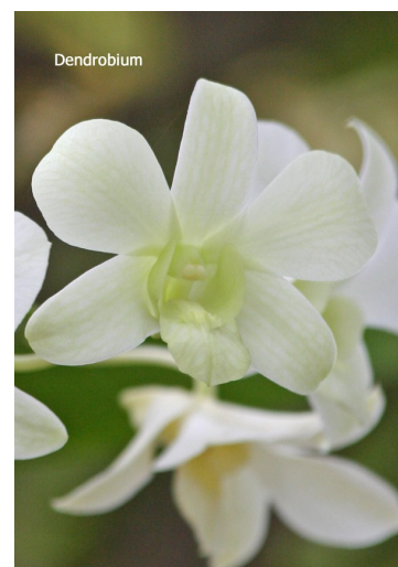
Taken in AOS garden