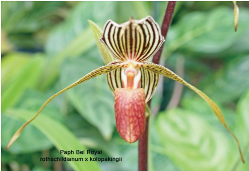
Paph Bel Royal rothschildianum x kolopakingii