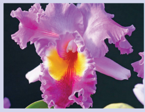
Lc. Color Guard 'Hawaii' - AOS Greenhouse May 2008

Do you have something to contribute to the FLOS Newsletter? We would love to see it! (Can't promise to use everything we receive.) Send your material to: