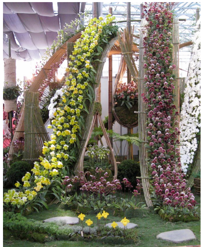
Paphiopedilum slides from the Taiwan International Orchid Show 2010.